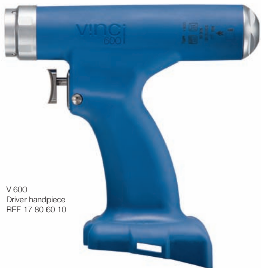
V 600 Driver handpiece REF 17 80 60 10