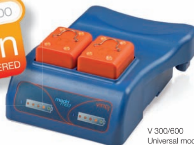
V 300/600 Universal modular charging station for battery pack V 300 Li-Ion and/or V 600 Li-Ion REF 05 16 69 00