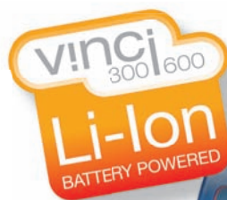
Battery pack REF 04 90 14 00