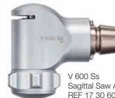
V 600 Ss Sagittal Saw Adapter REF 17 30 60 10