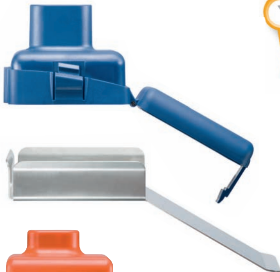
Battery housing REF 04 89 57 00