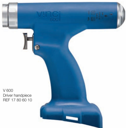
V 600 Driver handpiece REF 17 80 60 10